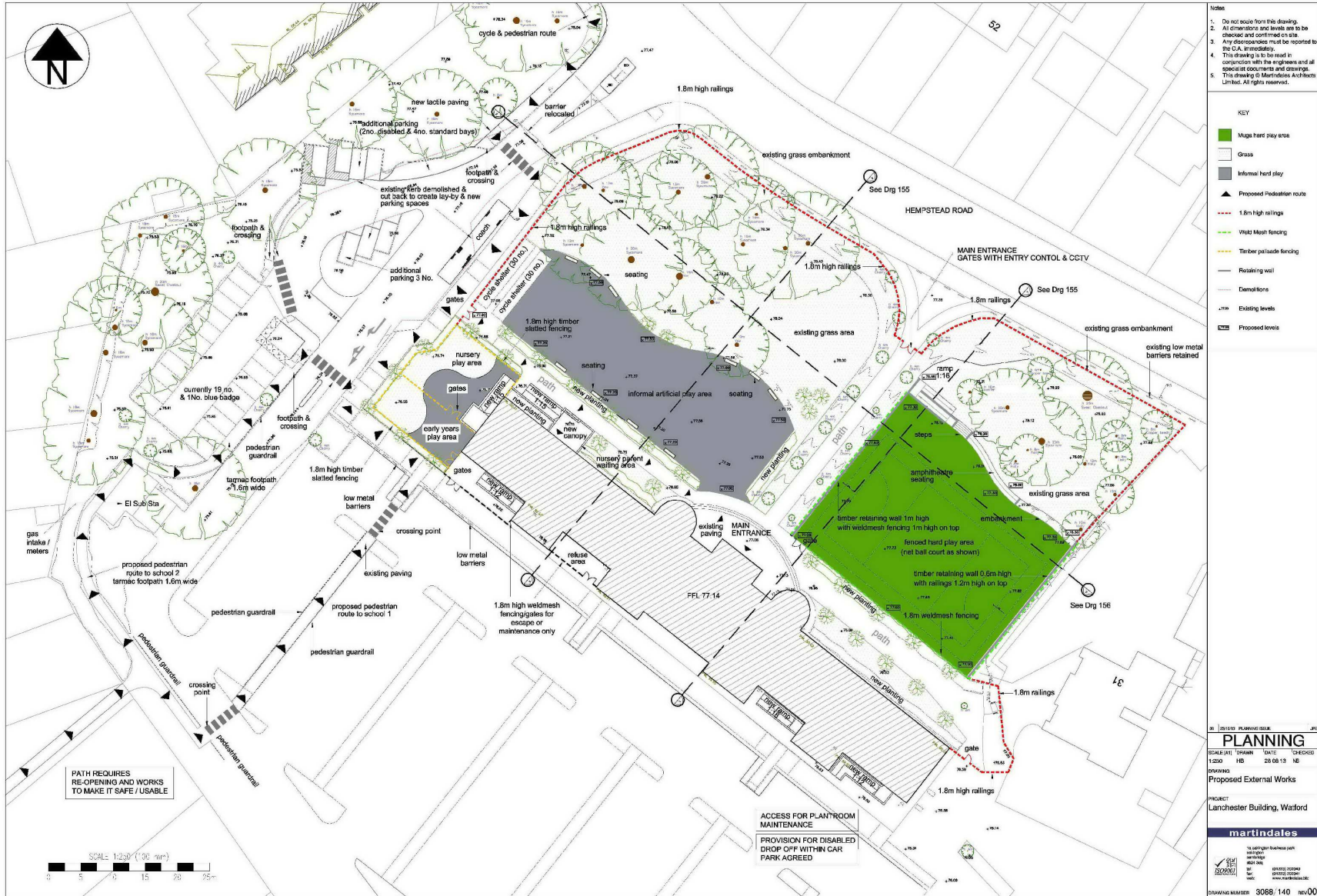
Site layout plan